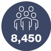
Railway Interchange Attendees