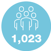
International Railway Interchange Attendees