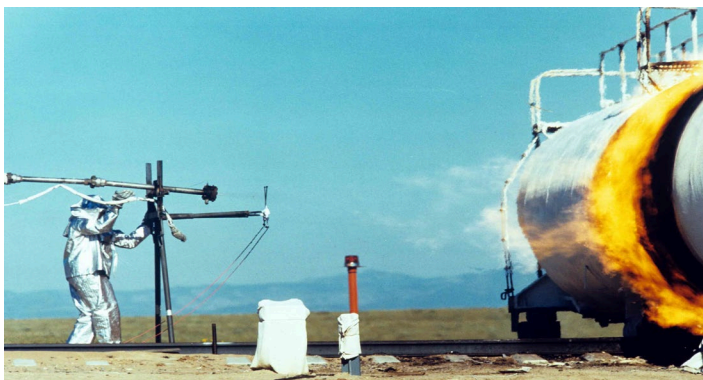
Example of full-scale testing in the early 1970s of an LPG tank car exposed to fire. Such tests, jointly conducted by the Safety Project and the Federal Railroad Administration, helped quantify the rate of heat transfer into a tank under intense fire conditions and led to thermal protection requirements for flammable gas tank cars and eventually additional tank car types.

Derailed tank cars can be exposed to fires of temperatures of over 1500°F, which may cause the tank steel to weaken and the lading to heat up. The tank car must be designed to retain the pressure for certain periods of time until emergency responders can mitigate the fire. Fire tests were part of the original LPG-car improvement research program, and more recently, the Safety Project has conducted high-temperature tensile and stress-rupture tests of tank steels to refine its understanding of how tank cars behave when subjected to intense heat. The Safety Project developed a physics-based model, AFFTAC (" A nalysis of F ire e ffects on T ank C ars "), to simulate how a tank car and the product carried therein behave when exposed to fire. The AFFTAC model estimates tank survival time, tracks behavior of the lading in the tank and the pressure relief system, and compares differences among commodities and fire protection systems. AFFTAC was originally based on the Federal Railroad Administration's (FRA) 1984 research study, thermal model and accompanying 1998 User's Manual, to conduct thermal analysis in order to understand the fire performance of thermal protection systems and tank car designs.