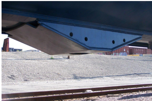
Bottom fittings on tank cars are protected with skids that deflect impacts with the ground, rails and other freight cars during a derailment.